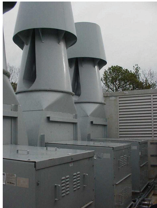
One of the two three fan Axijet installations

Berry College's Science and Biology Building has 3 Axijet exhaust systems consisting of 7 Axijet High Plume Dilution Blowers, exhausting approximately 190,000 CFM.